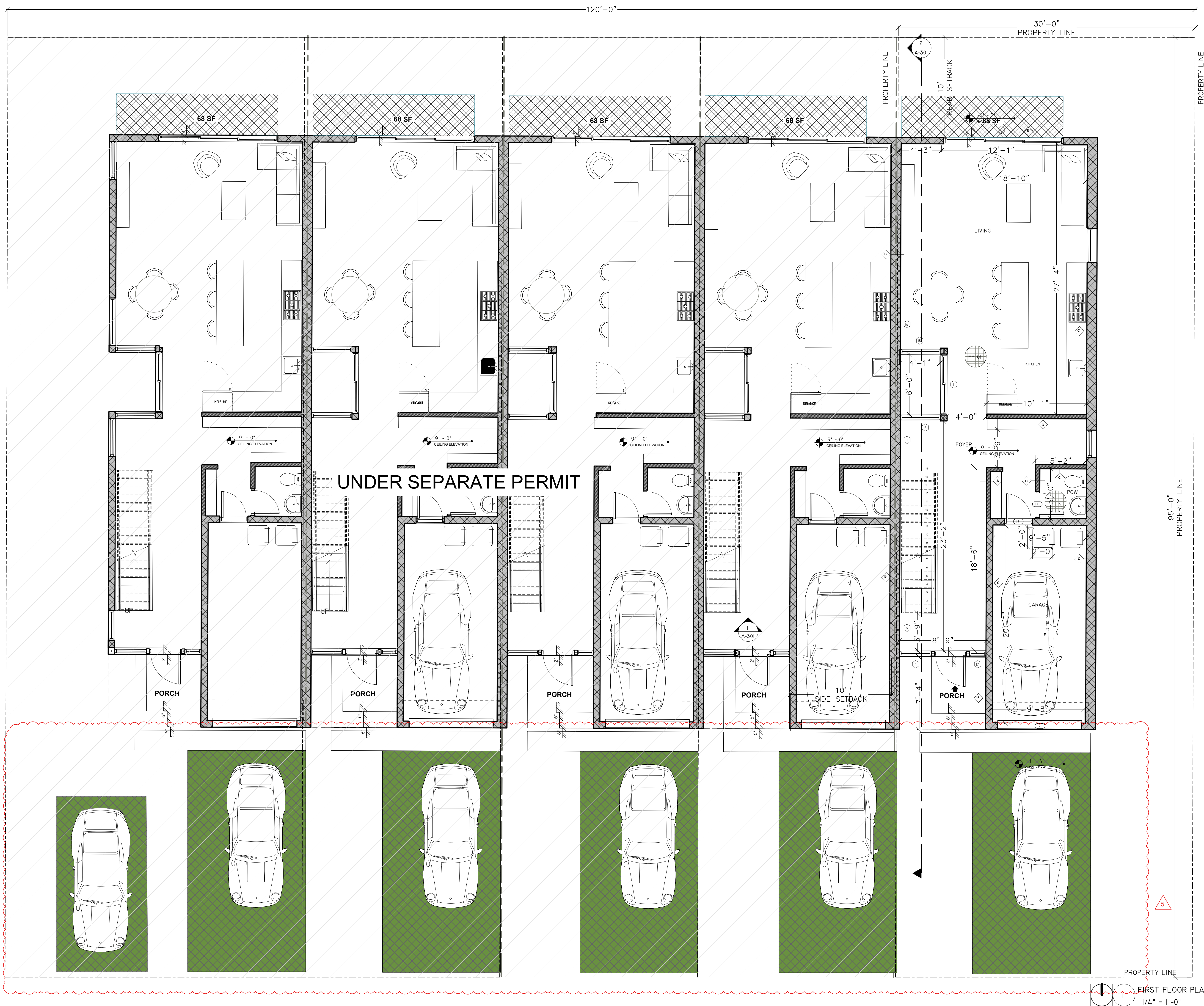
FIRST FLOOR PLAN 1/4" = 1'-0"